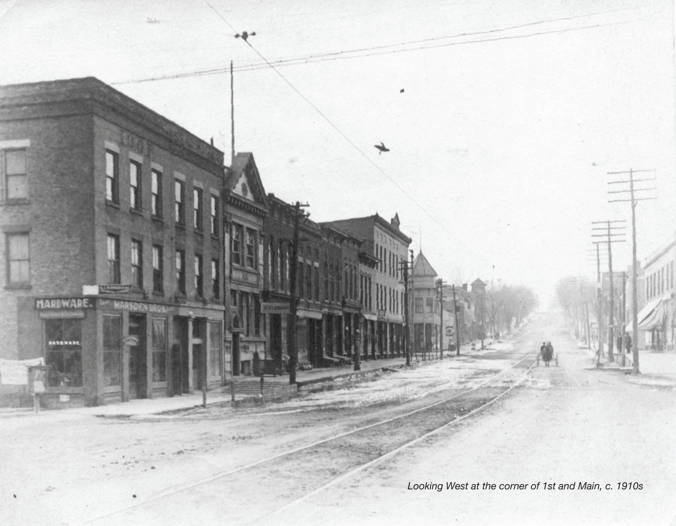
Looking West at the corner of 1st and Main, c. 1910s