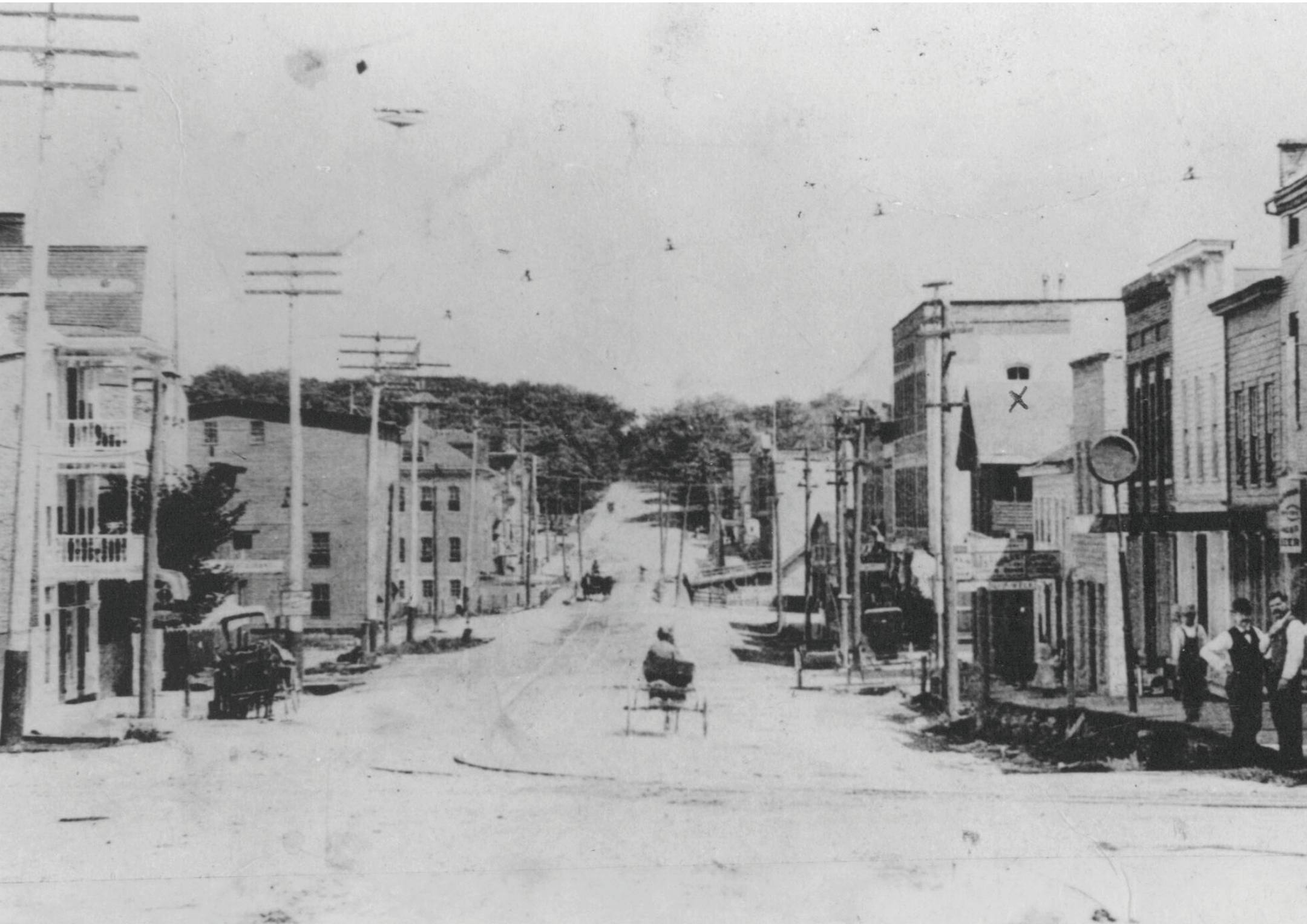
Looking East on Main Street, c.1880s