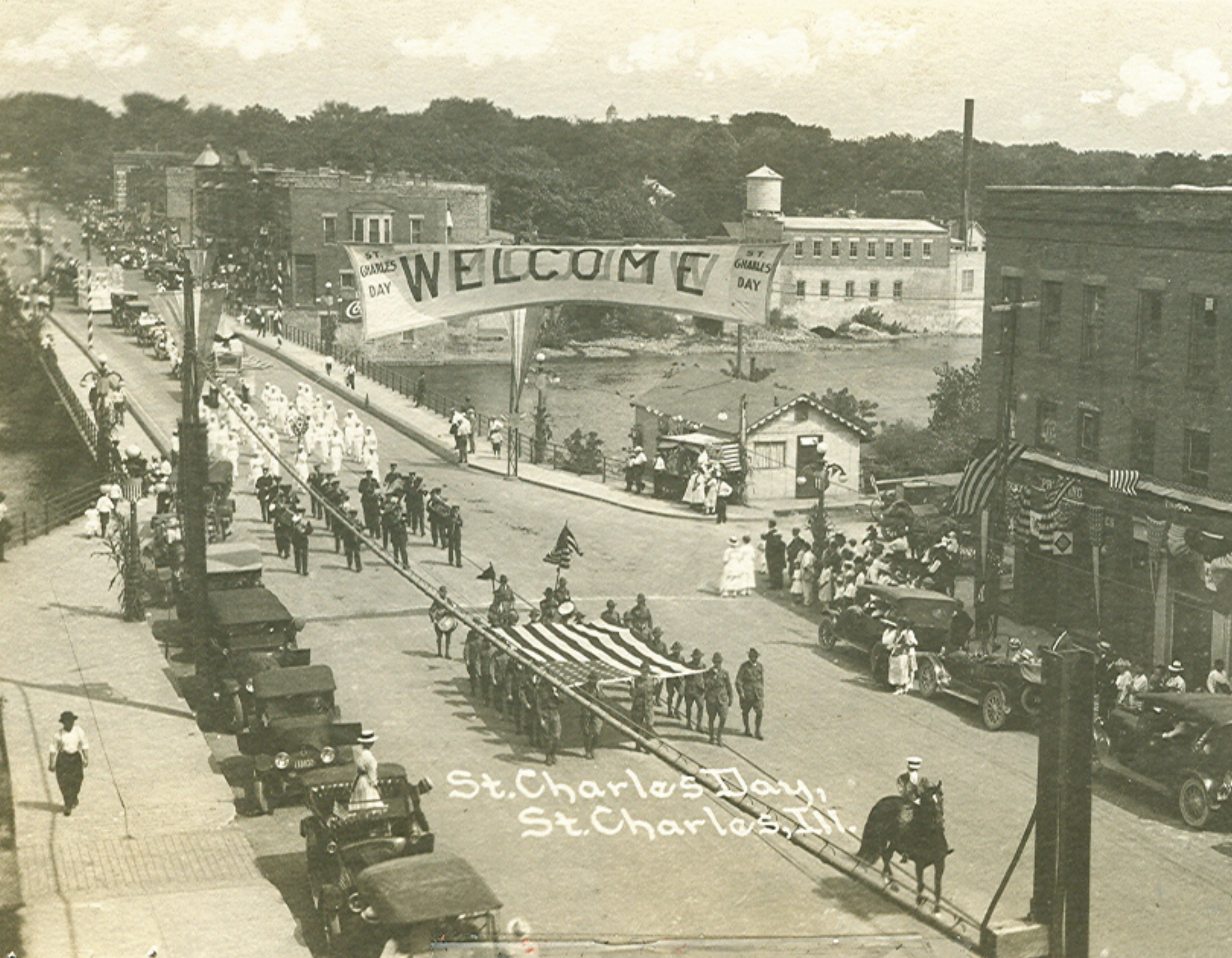
St. Charles Day, St. Charles, Ill.